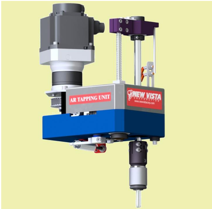
Basic AR Tapping Unit