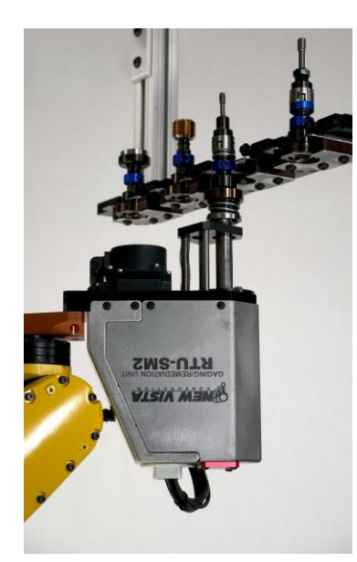
Type J Tool Docks can be employed in any orientation.

This is what is included in a typical RTU shipment to a New Vista customer. The controls componentry you see here is also available cabinet-mounted, with everything wired in.