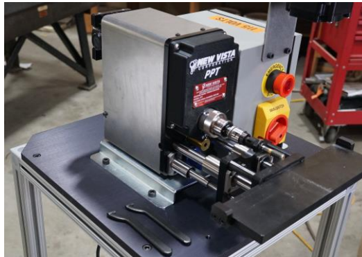
A PPT with custom tooling and green flash option

— Inexpensive push-pull machines for thread resizing, thread verifying, chasing or retapping —