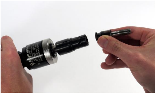
Tool Adapters snap into place.